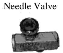
Needle Valve #FTC-03-NPT