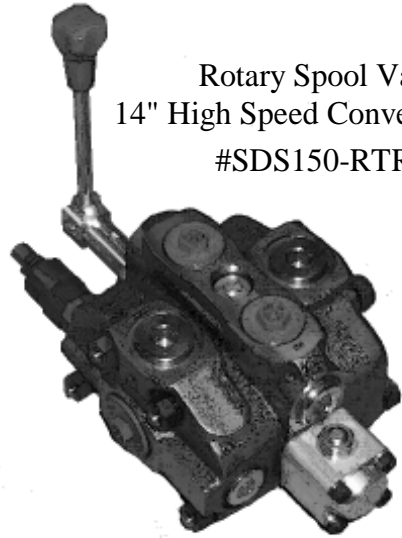
Rotary Spool Valve 14" High Speed Conveyor Valve #SDS150-RTRY