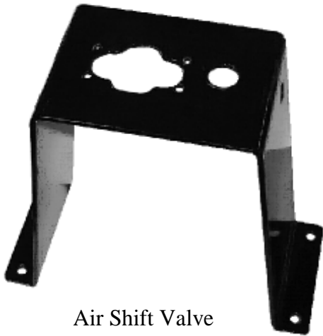
Air Shift Valve High Mounting Tower # ASVT-08