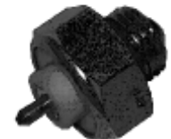
PTO Ground Sending Unit (White) #30T38111