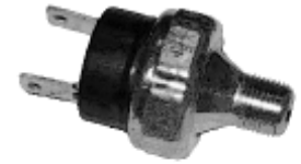
Dry Valve Air Pressure Sensing Unit #FSC-1749-2134