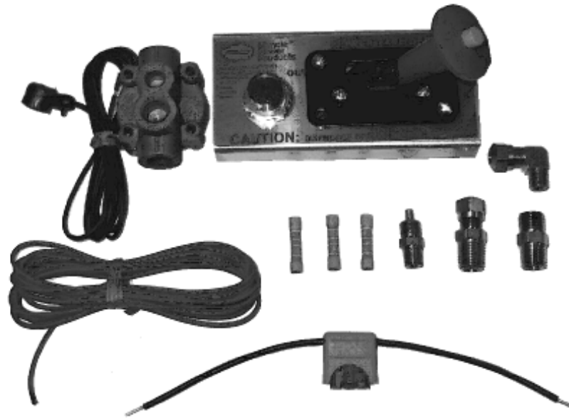
TG Series Standard Air Shift Kit #48M61250-A