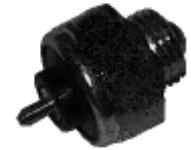
PTO Ground Sending Unit (Black) #30T38110